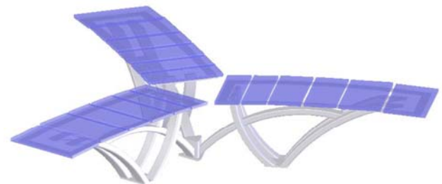
Intersect Bench without Center Tablet Arm