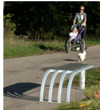
Balance Bench no Tablet Arm