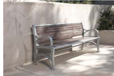
Kenton Bench with Recor Slats