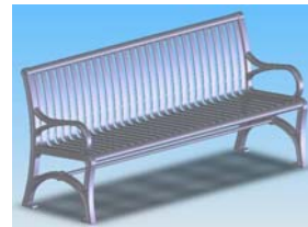
Kenton Bench with Vertical Slats