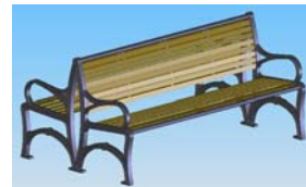
Shown Back-To-Back with IPE