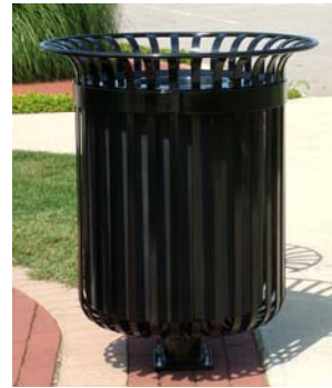
Top Opening – Surface Mount