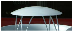
Dome Lid – Side Opening